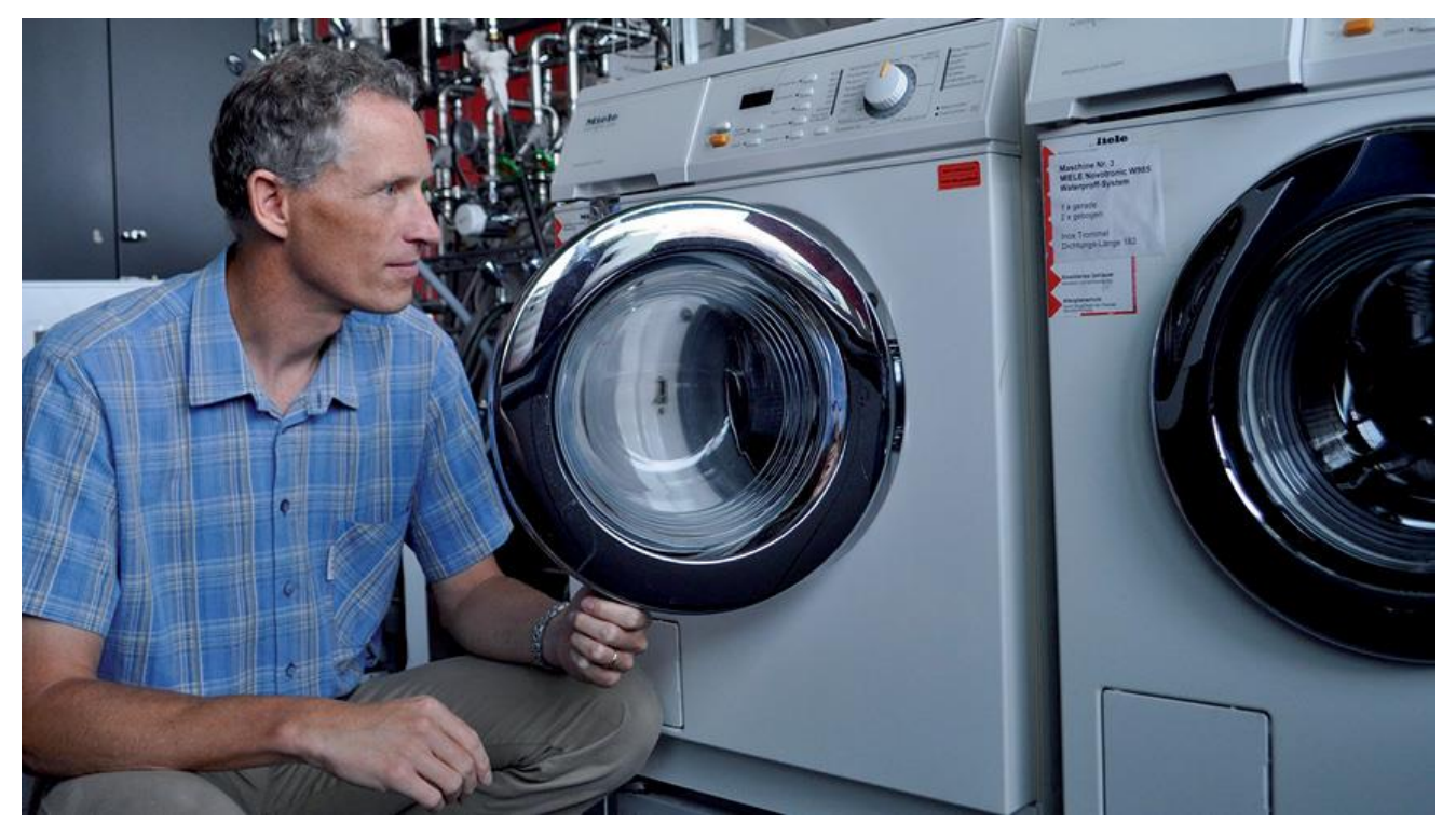
Researchers led by Bernd Nowack have investigated the release of nanoparticles during the washing of polyester textiles.

When nanoplastics are not what they seem ... Textiles made of synthetic fibers release micro- and nanoplastics during washing. Empa researchers have now been able to show: Some of the supposed nanoplastics do not actually consist of plastic particles, but of water-insoluble oligomers. The effects they have on humans and the environment are not yet well-understood.