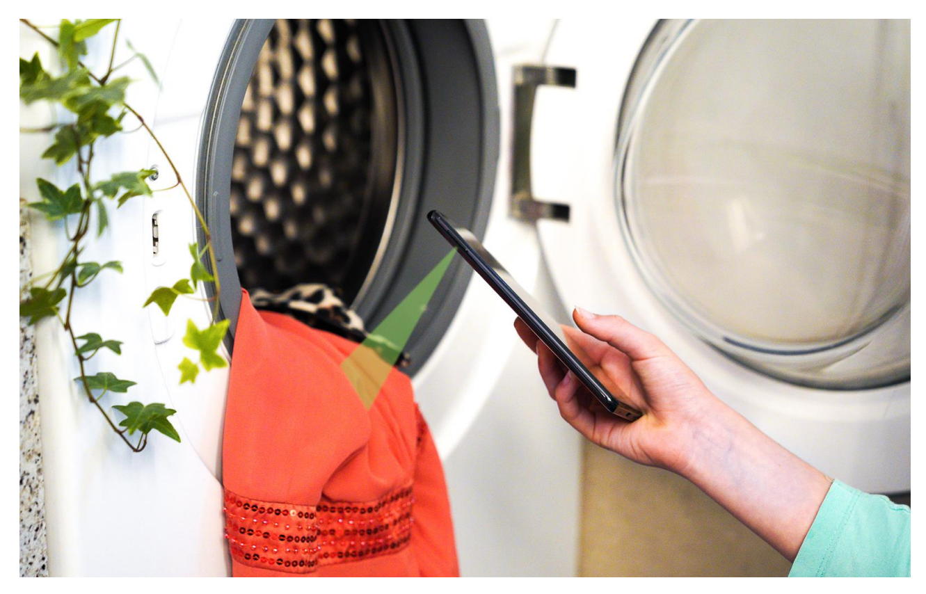
If the label with cleaning instructions is no longer legible: A quick check with a smartphone, and the integrated spectrum analyzer recognizes the fabric the garment is made from. This allows to set the correct wash cycle.

Researchers at Fraunhofer have developed an ultra-compact near-infrared spectrometer suitable for recognizing and analyzing textiles. Mixed fabrics can also be reliably identified through the combination of imaging, special AI (artificial intelligence) algorithms and spectroscopy. The technology could be used to optimize recycling old clothing, so old apparel could be sorted according to type. A highly miniaturized version of the system can even fit into a smartphone. This could lead to a host of new applications for end-users in everyday life — from checking clothes when out shopping to detecting counterfeits.