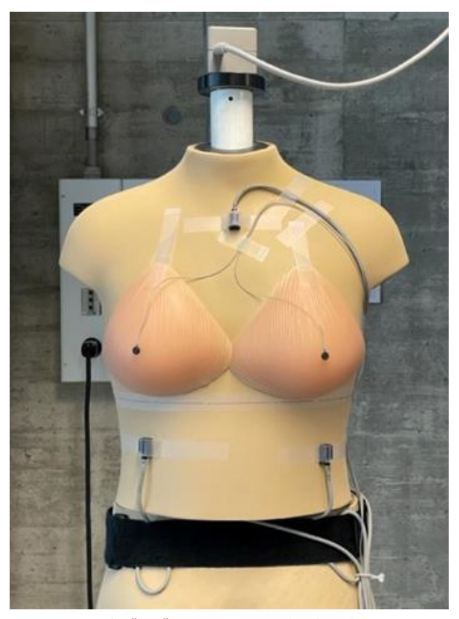
The "Nici" mannequin was developed to investigate the mechanical properties of bras.