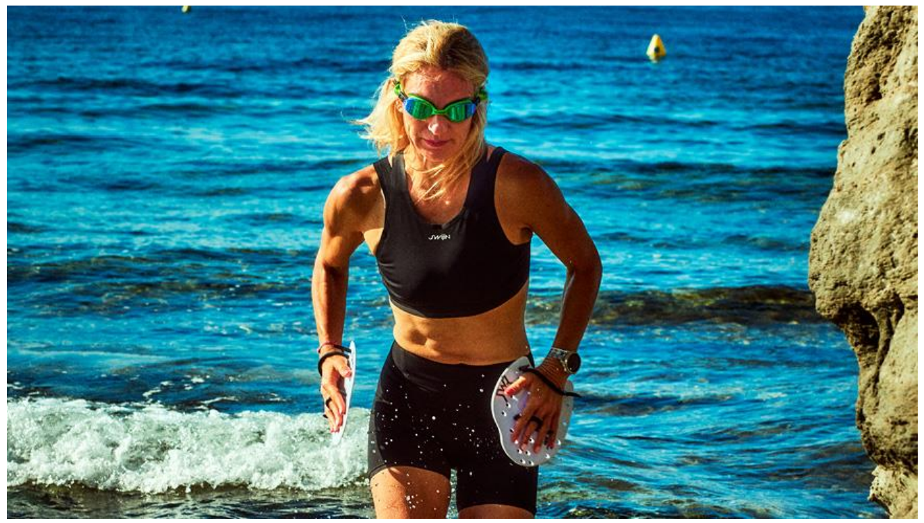
During swimrun races, athletes switch back and forth between swimming and trail running, which puts high demands on their sportswear.

Just in time for summer: The Swiss start-up Swijin is launching a new sportswear category with its SwimRunner — a sports bra together with matching bottoms that works as both swimwear and running gear and dries in no time. The innovative product was developed together with Empa researchers in an Innosuisse project. The SwimRunner can be tested this weekend at the Zurich City Triathlon.