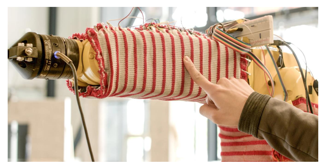
RobotSweater, developed by a research team in the Robotics Institute and shown here on a robotic arm, is a machine-knitted textile "skin" that can sense contact and pressure.

RobotSweater, developed by a research team from Carnegie Mellon University's Robotics Institute, is a machine-knitted textile "skin" that can sense contact and pressure.