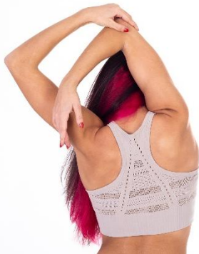
Yoga Capsule collection by Iluna Group with ROICA™ EF and Q-NOVA® by Fulgar

An important step forward in responsible innovation is BIOLINE , the biodegradable collection made by the world's first biodegradable polyamide 6.6 yarn AMNI SOUL ECO® by Fulgar and premium stretch fiber ROICA™ V550 - belonging to the ROICA Eco-Smart™ family - and matching the need for elasticity and comfort and offering additional and relevant