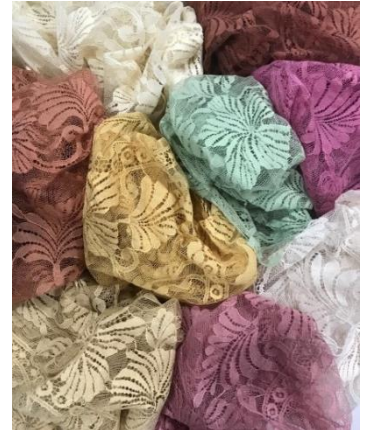
Color chart of natural based dyestuffs

Paris, 11-13 February 2020 – Advanced design and sustainability, innovation, aesthetics and quality made of “ethical” laces and tights of very high quality standards and an attentive look at fashion. Iluna Group , strengthened by this heritage, returns to Paris, this time to Première Vision, with an eco-sustainable lace collection and the brand new Yoga Capsule collection. Smart approach, carefully selected materials, process know-how and particular attention to the ecosystem are the key points of the Cuggiono company, leader in its sector. For the Green Label line, Iluna uses responsible premium ingredients such as GRS certified Q-NOVA® , more than half of which are made from pre-consumer waste and GRS ROICA™ EF certified premium stretch yarn produced by more than 50% from transformed pre-consumer content. The yarn belongs to the ROICA Eco-Smart™ family produced by Asahi Kasei and is the world's first responsibly made premium fiber range, which includes smart ROICA™ yarns and their exceptional certifications. Great news are the natural dyes made with GOTS certified plant-based dyes. A surprising color chart with OEKO TEX® Standard 100 solidity.