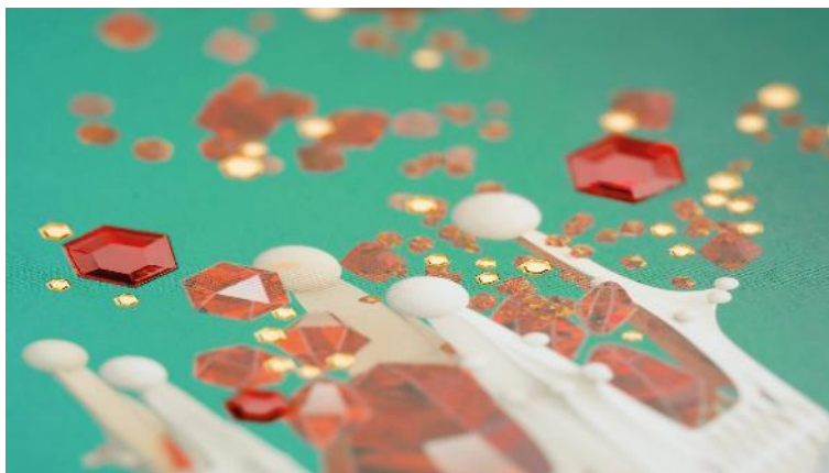
Image 3: Targeted finishing options such as embossing, foil stamping, die-cutting or varnish enhance the user experience even further.