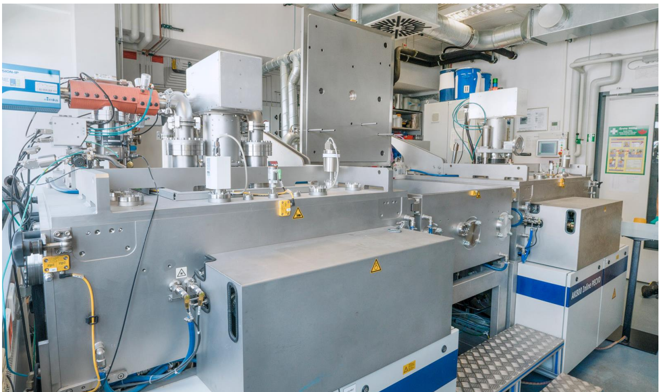
Chemical vapor deposition (CVD) coating plant used to produce functionalized textiles.