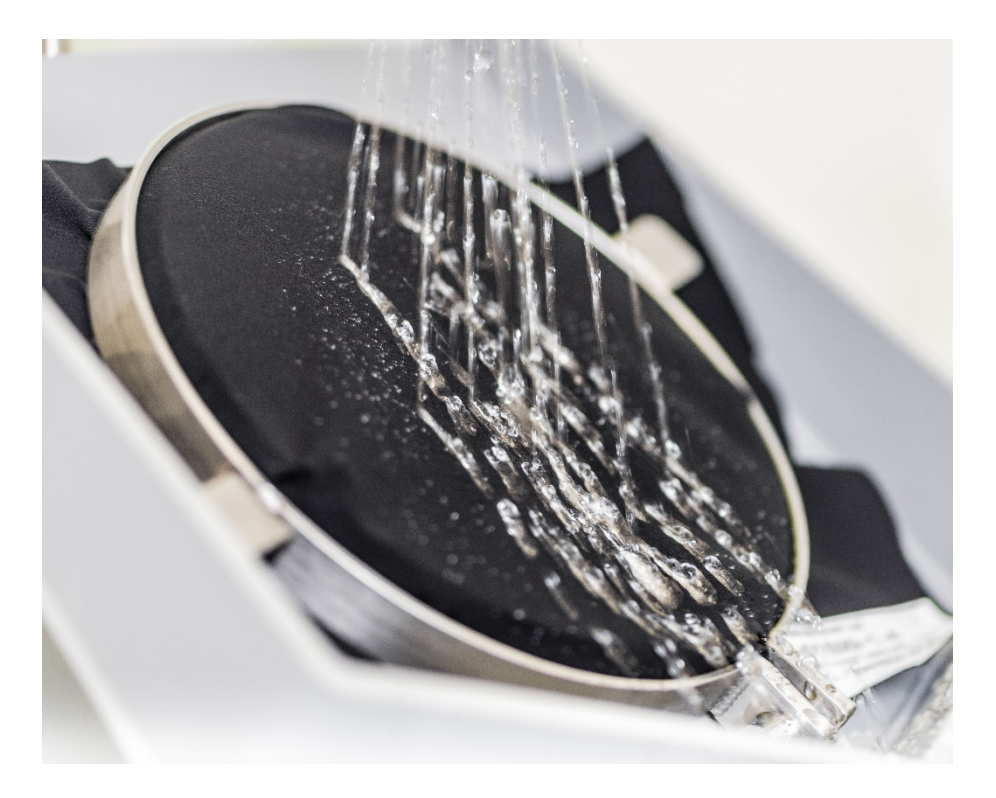
Image: Evaluating the DWR performance using the spray test method at HeiQ laboratories (HeiQ)