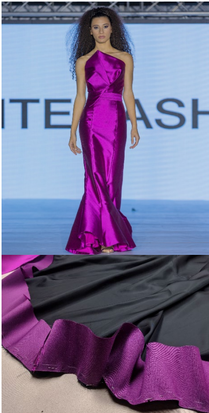
Fite Fashion's gown with Bemberg™ lining

Bemberg™ is committed to foster young smart creativity as clearly demonstrated by the choice to shed the light on an emerging