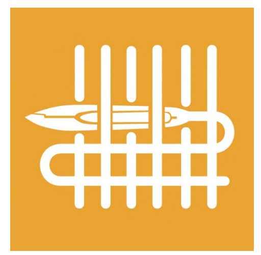
New at Heimtextil: stand logo for weavers

On a continued growth trajectory: the upcoming Heimtextil (7-10 January 2020) will once again offer an expanded range of products in the "Decorative & Furniture Fabrics" segment. Around 900 manufacturers and wholesalers, including 40 new exhibitors, will present a globally unique range of diverse items. For better orientation of visitors, Heimtextil will be identifying weavers of decorative fabrics and furniture fabrics, curtains and materials for bed linens with a special icon on each of their stands for the first time.