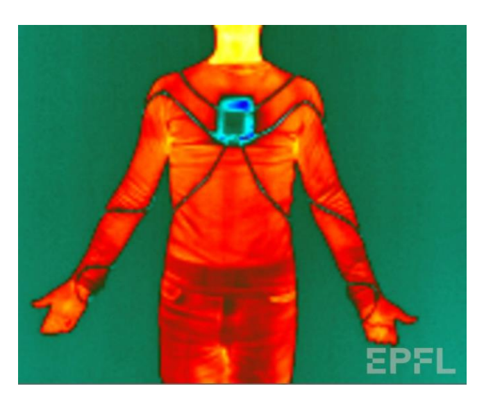
Infrared image of the pumps integrated into a t-shirt

The pump could even bring a new dimension to the world of virtual reality by simulating the sensation of temperature. In this case, users wear a glove with pumps filled with hot or cold liquid, allowing them to feel temperature changes in response to contact with a virtual object.