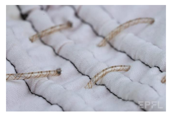
The fiber pumps woven into fabric