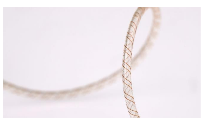
The LMTS fiber pump