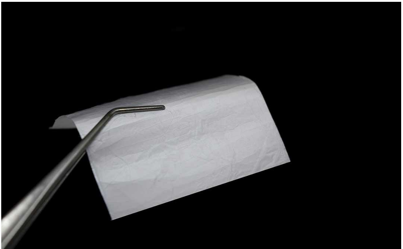
Electrospun Renacer® membrane (5 x 5 cm)

Fraunhofer researchers have succeeded in using the bioresorbable silica gel Renacer® to produce an electrospun membrane that is neither cytotoxic to cells nor genotoxic. This model mimics fibrous structures found in connective tissue and is therefore particularly suitable for regenerative applications, such as for improved wound healing.