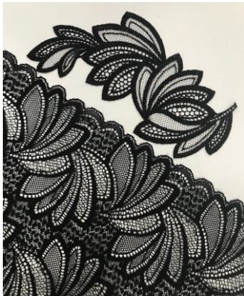
Lace and embroidery by Iluna Group with ROICA™ EF

A relevant achievement for the firm that, thanks to the Green Label collection, now even richer, make responsible innovation an asset for production that focuses on smart