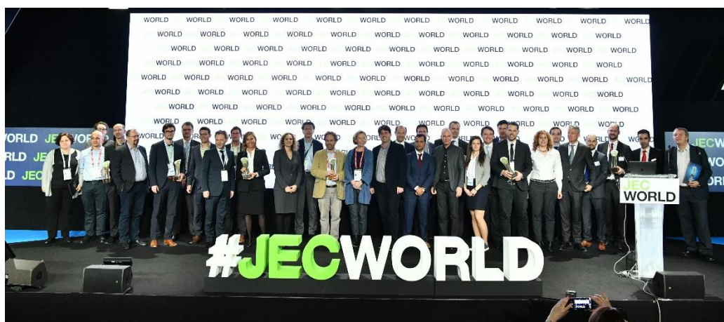
The 11 winners of the 2019 JEC Innovation Awards with the jury