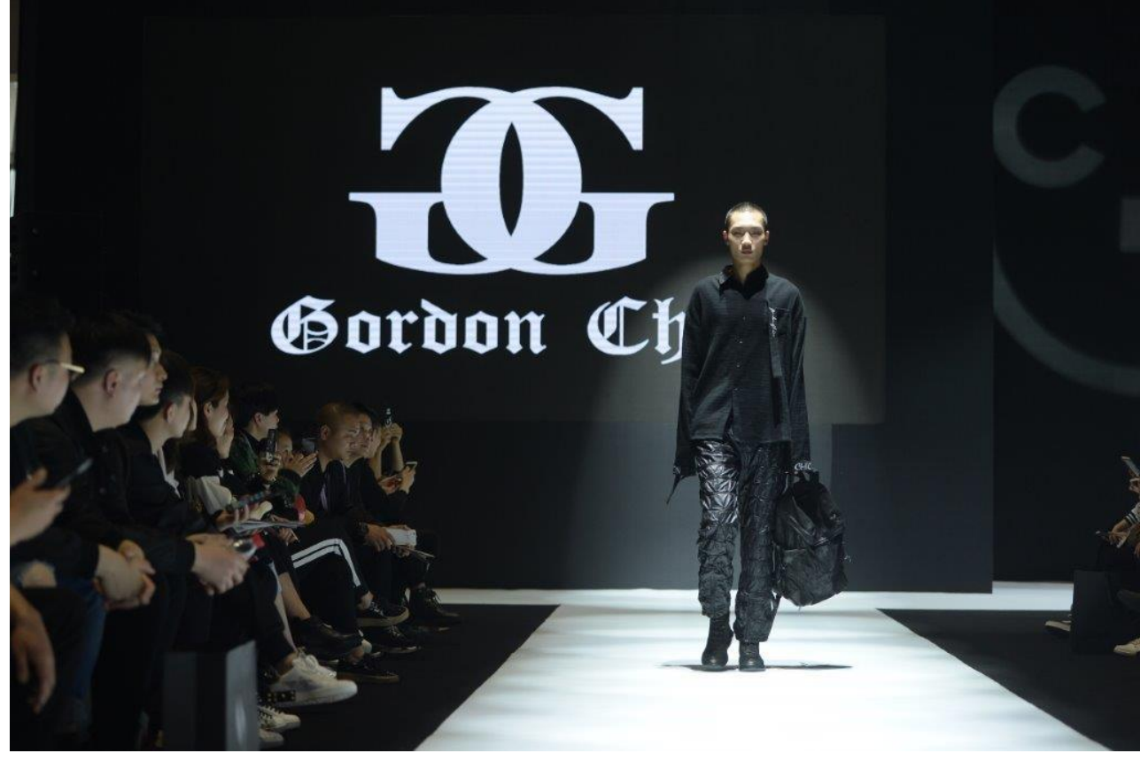
Seminars and shows

CHIC is visited by representatives of all distribution channels for distribution in the Chinese market, at the last event in autumn 2017 more than 65,722 visitors from all over China and other nations were registered at the CHIC, with a significant increase in multi brand stores.